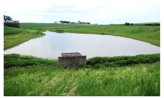
Slow release of water after a heavy June rainfall on June 28, 2018. Picture was taken seven months after the sediment cleanout project.

50 and 100-year rainfall events by up to 25% (MDNR HMS Modeling, 2016). Reducing peak flow can help reduce potential flooding impacts to downstream communities like Preston and could also help reduce streambank erosion on the main stem of the Root River. A 2016 sediment source study (Belmont, 2016) estimated that streambank erosion accounts for over 40% of the sediment load at the outlet of the Root River. The study found that Root River sediment concentrations increase with river flow at a greater rate than almost any other river in Minnesota due to the many large, accessible and easily erodible streambanks. Maintaining structures like E3 is a cost-effective practice for helping obtain water quality goals in the Root River Watershed.