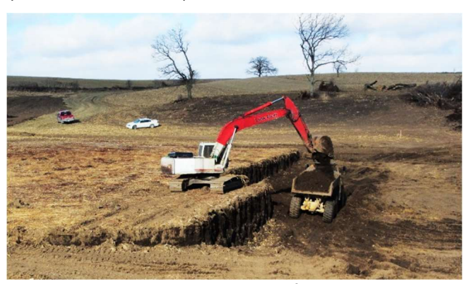
This picture taken in early December of 2017 shows the excavation of nearly 60 years of topsoil, up to nine feet deep, within the structure pool area.

This project was considered a high priority for the watershed study since 45% of the watershed drains to this area and has the capacity to store 23 million gallons of runoff at the principal spillway and nearly 70 million gallons at the emergency spillway. Estimates indicate flood retention structures can help reduce peak flow runoff volume during 10,